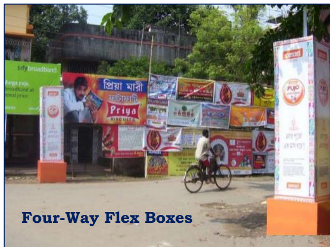
Four-Way Flex Boxes