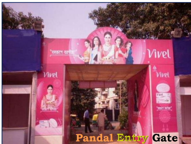
Pandal Entry Gate