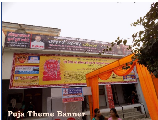
Puja Theme Banner