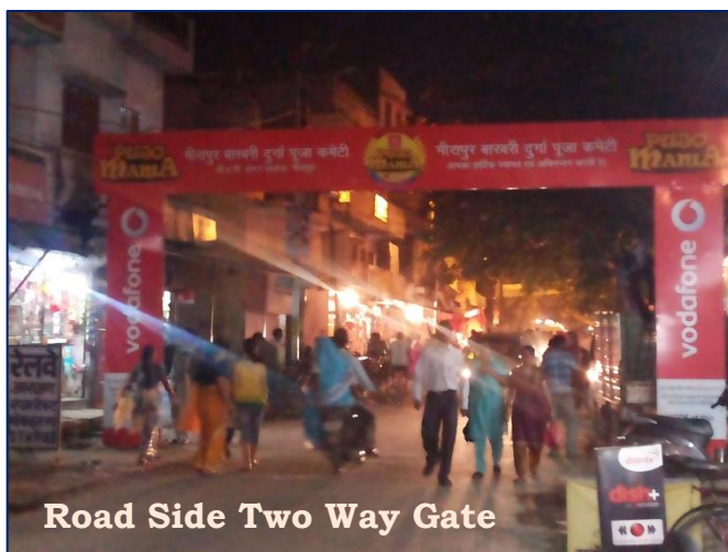
Road Side Two Way Gate